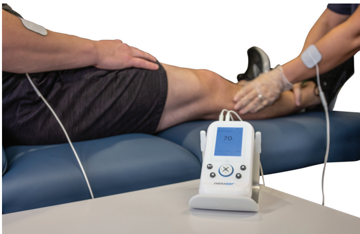
Fig 1. Administering deep oscillation therapy through vinyl gloves while performing manual therapy. Note that the clinician has an electrode on their forearm the patient has one on their arm to complete the electrostatic field

because it allows for the transmission of the electrostatic field into the patient while also allowing the clinician to perform manual therapy techniques (figure 1). A small amount of talcum powder is applied to the treatment area to absorb any perspiration on the surface of the skin and to allow for an easier glide of the gloved hand(s) on the skin. The massaging effect created by the electrostatic field and the manual therapy techniques works to increase blood flow and to open the lymphatic system to increase lymphatic return. It is recommended that the DOT session begin with treatment to lymphatics that are proximal to the edematous area to clear the area and open the lymphatic system. Once this is completed DOT can be applied over the edematous area with emphasis on using manual therapy techniques that focus on removing edema and maintaining and improving tissue mobility. The total treatment time can last from 15 minutes to 60 minutes based on the treatment objective and patient's response.