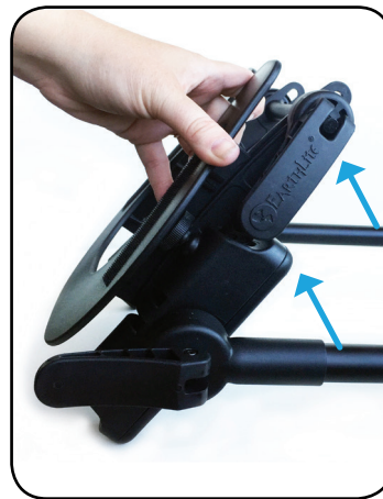
3. Pull platform away from the base