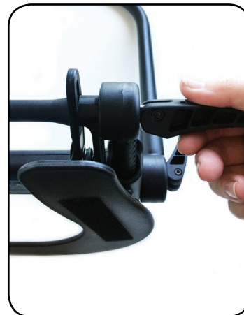
6. Push up to unlock/loosen