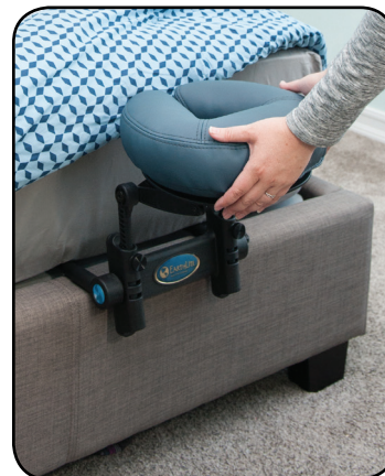
10. Push in all the way to secure, and attach FacePillow to the platform