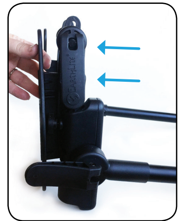
4. When in a fully upright position, tighten/lock lower adjustment knob