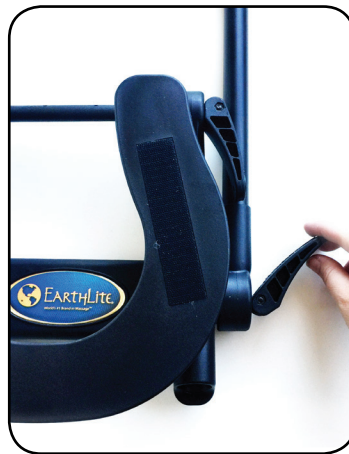
2. Push up to unlock/loosen