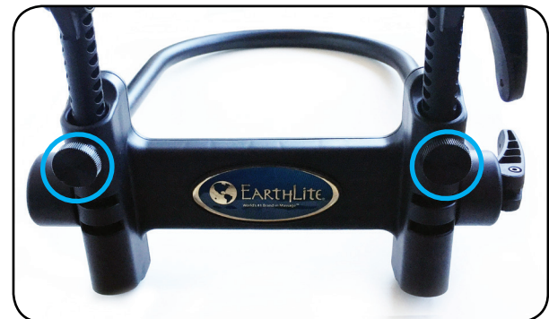
11. Use height adjustment knobs to adjust height of the FacePillow (if necessary)