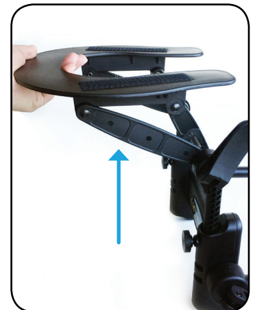
8. When in a fully upright position, tighten/lock upper adjustment knob