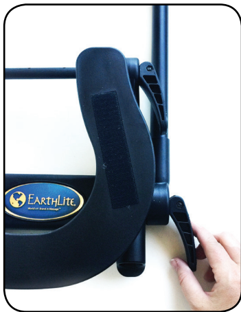
1. Locate lower adjustment knob

Always use caution when making any position adjustments. Ensure all body parts are clear from all moving parts. Do not make adjustments while product is in use or with any weight on the platform.