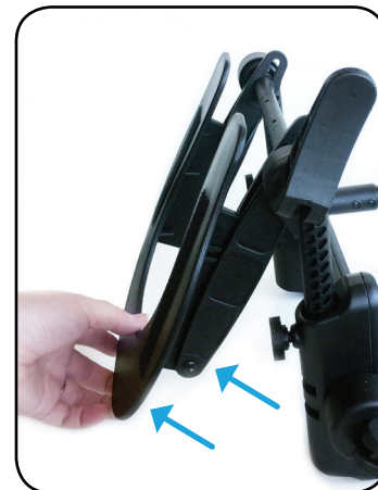
7. Pull platform away from the base